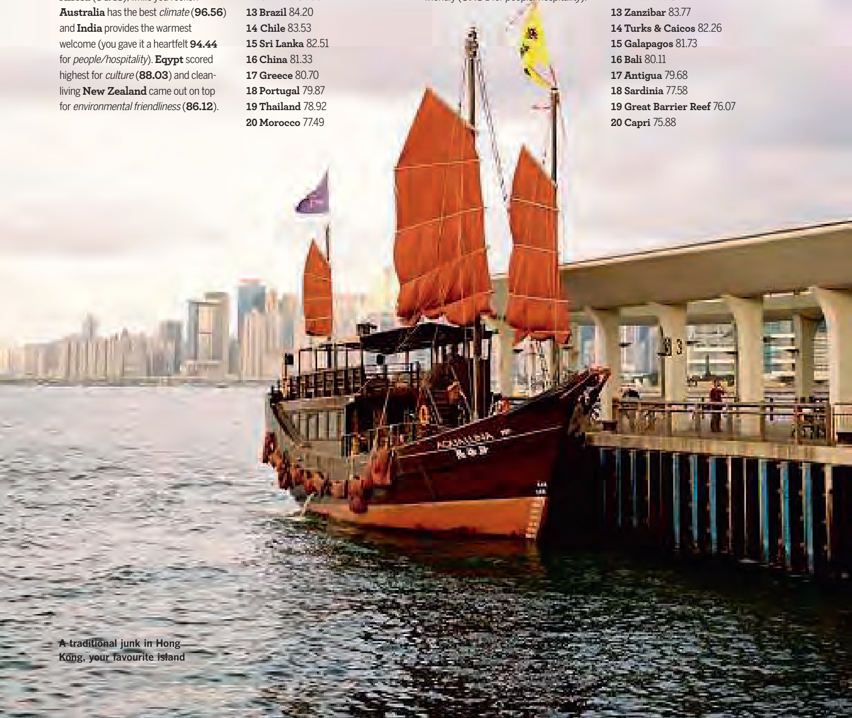
A traditional junk in Hong Kong, your favourite island